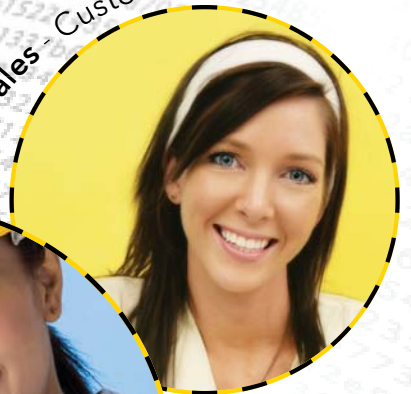
Sales - Customer basis