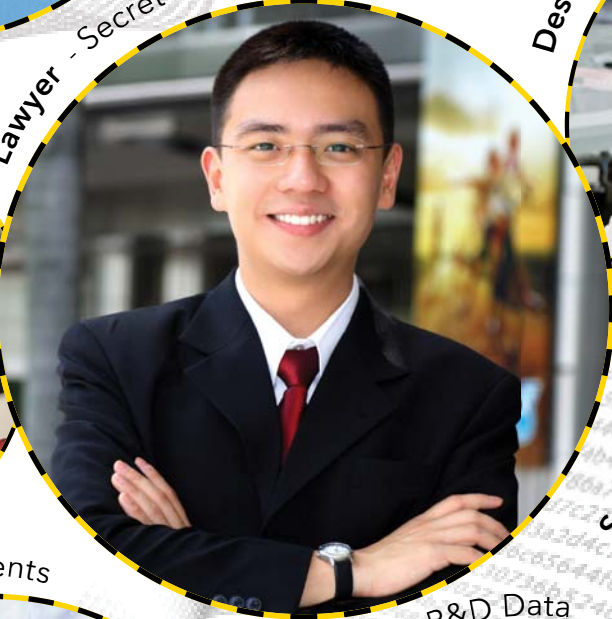
Lawyer - Secret information