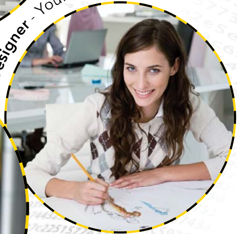
Designer - Your drafts