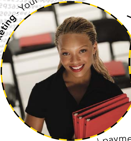
Marketing - Your campaign