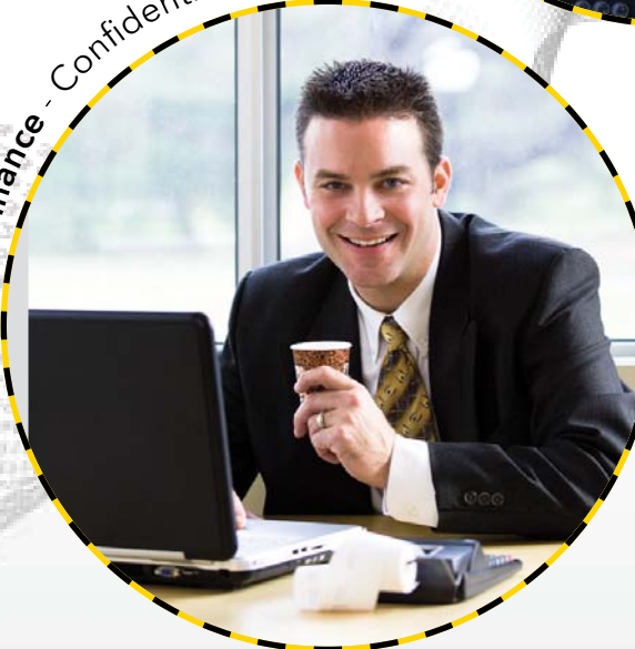
Finance - Confidential payments