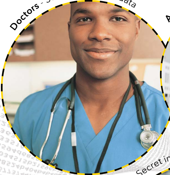
Doctors - Sensitive patient data