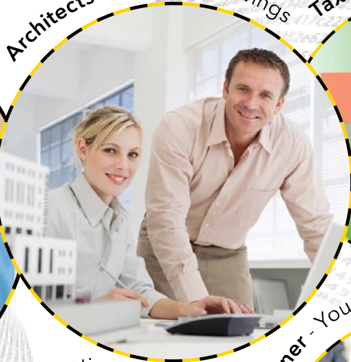
Architects - Valuable drawings